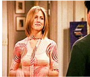
James Franco Nails Rachel's Iconic Hair in this Hilarious 'Friends' (Mimi)