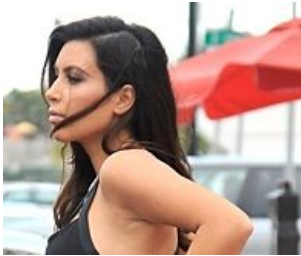
Kim Kardashian's Short Skirt Caused A Major Scene